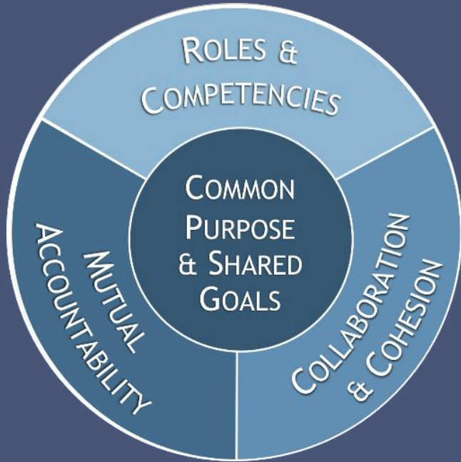
The Corentus Team Wheel™ Key Dimensions of Team Effectiveness